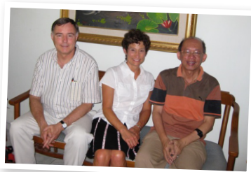
Same trio as above in 2008 during VIA Alumni Tour

Our VIA adventure started in 1972 with a wedding—ours. Four days later we were off to Indonesia for two years on what some called a honeymoon. After Asia came grad school, careers and kids, but by 1983 we were helping organize VIA's 20th anniversary. Two separate stints on VIA's board followed (for a total of 20-plus years), then organizing four VIA alumni trips to Myanmar and one to Vietnam-Cambodia. Among the more memorable VIA occasions at our from Indonesia, Myanmar, Japan, Taiwan and China. Stuck in there was a six-month term as VIA's interim executive director, a Last American Supper for outgoing fellows, and multiple efforts to explain Silicon Valley to VIA visitors to Stanford. Why? VIA just sticks with us and enriches our lives. It's not that we were with VIA, we still are and will always be. As a one-time VIA slogan holds, VIA changes lives, ours and thousands more.