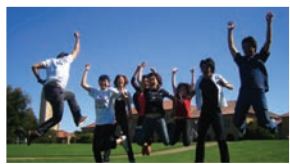
LANGUAGE & CULTURE