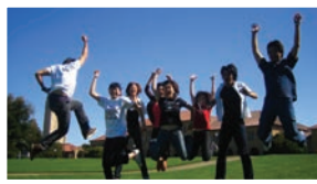
LANGUAGE & CULTURE