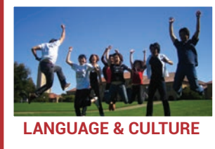
LANGUAGE & CULTURE