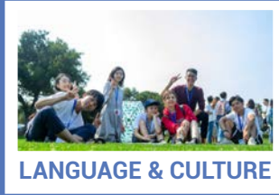
LANGUAGE & CULTURE