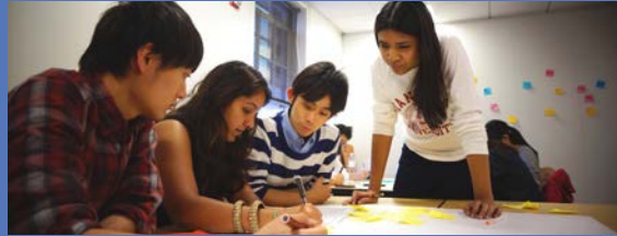
DESIGN-THINKING FOR SOCIAL INNOVATION