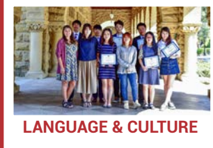
LANGUAGE & CULTURE