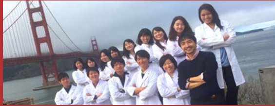
EXPLORING HEALTH CARE