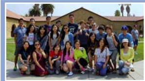
LANGUAGE & CULTURE