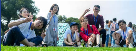
AMERICAN LANGUAGE & CULTURE